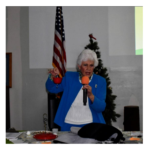
Hummingbirds of the White Mountains Program

The Nature Center needs you! Register for our new Volunteer Force and help us do more than ever to connect people with nature! Click here to get started: WMNCVolunteerSignup