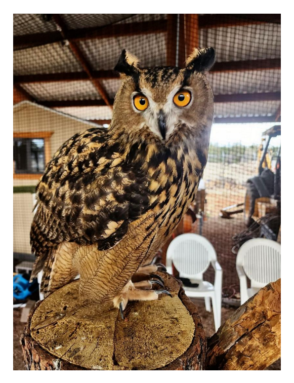
a week ago on his stump. For his birthday he will get a 'cupcake' full of frozen mice with a candle on top. Takes a white to eat, but so good!