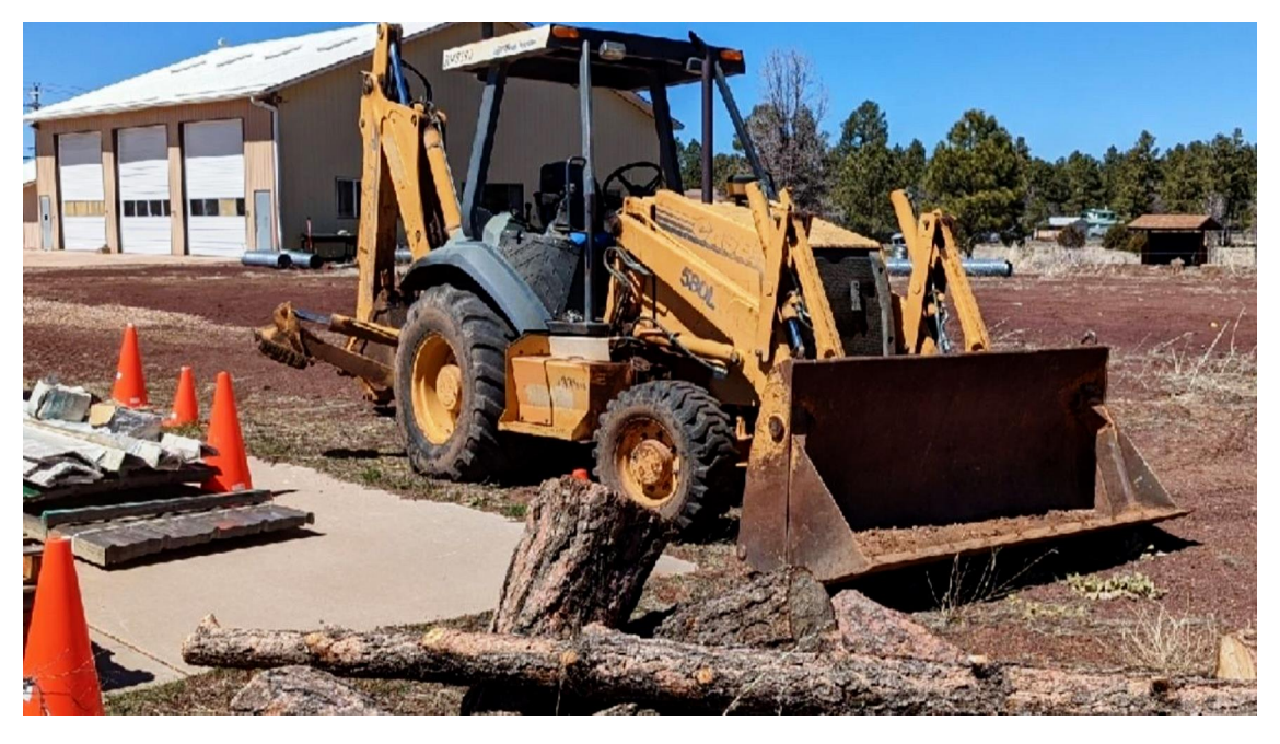
Our new contractor is beginning construction on the Food Prep Building and the new bird enclosures ("Mews").

The new 15 x 15 ft enclosures will have many perching opportunities, and room to fly! Our birds have been waiting all winter for this!