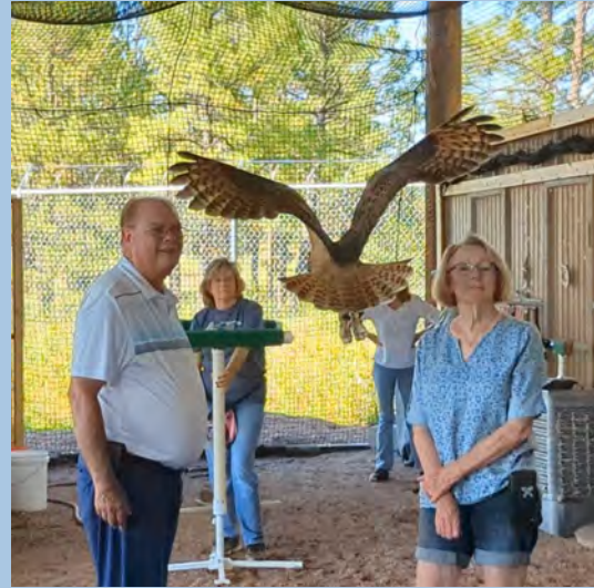
Whew! Glad Funky knew what to do, even if it was at the last second!