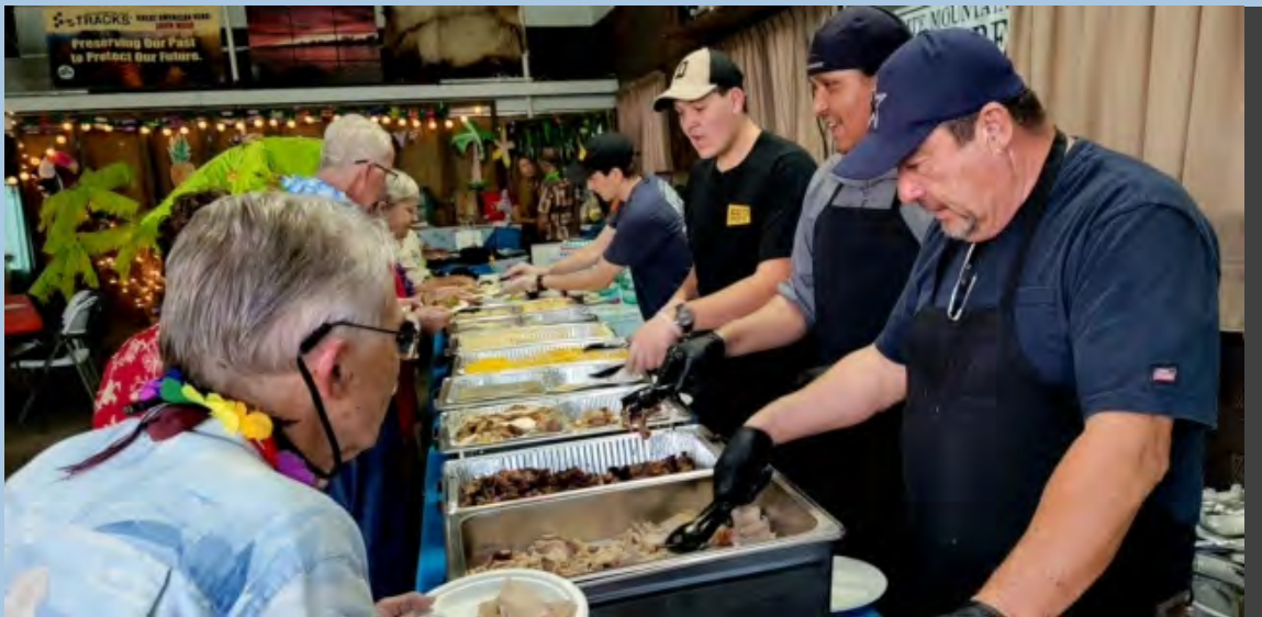
The buffet line was worth the wait! Roast pig, Bar-B-Que sauces, chicken, potatoes, even Mac & Cheese! And everyone shared their desserts from the auction! :-)