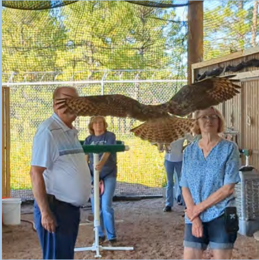
Looks like trouble! Who signed us up for this "Funky Experience?"

If you want to donate, click here and then click the Raptor Show Donation button - we need your help to feed and care for our show ambassadors and to build their new enclosures and viewing area. Thank you so much!