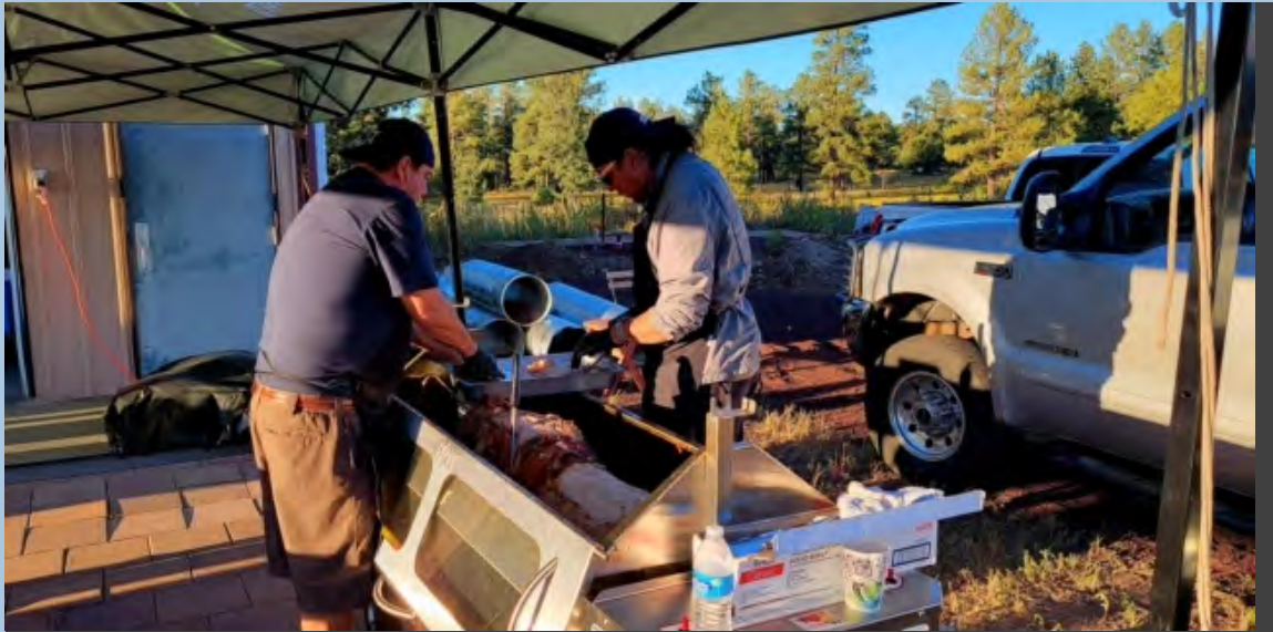
White Mountain Country Club chefs started the pig roasting early in the morning!

roast pig donated by the White Mountain Country Club made the scrumptious buffet irresistible.