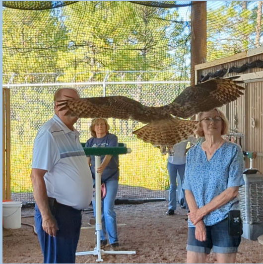
Looks like trouble! Who signed us up for this "Funky Experience?"

and to build their new enclosures and viewing area. Thank you so much!