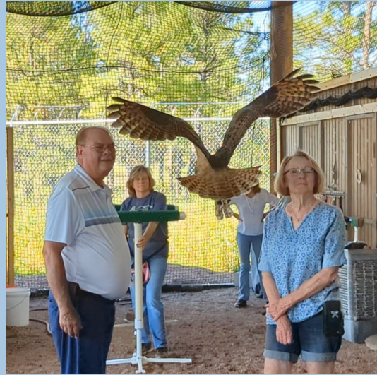
Whew! Glad Funky knew what to do, even if it was at the last second!