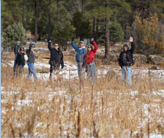
BEFORE: Our merry group departs!