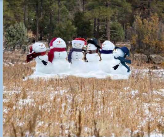
AFTER: A little snow to brush off!