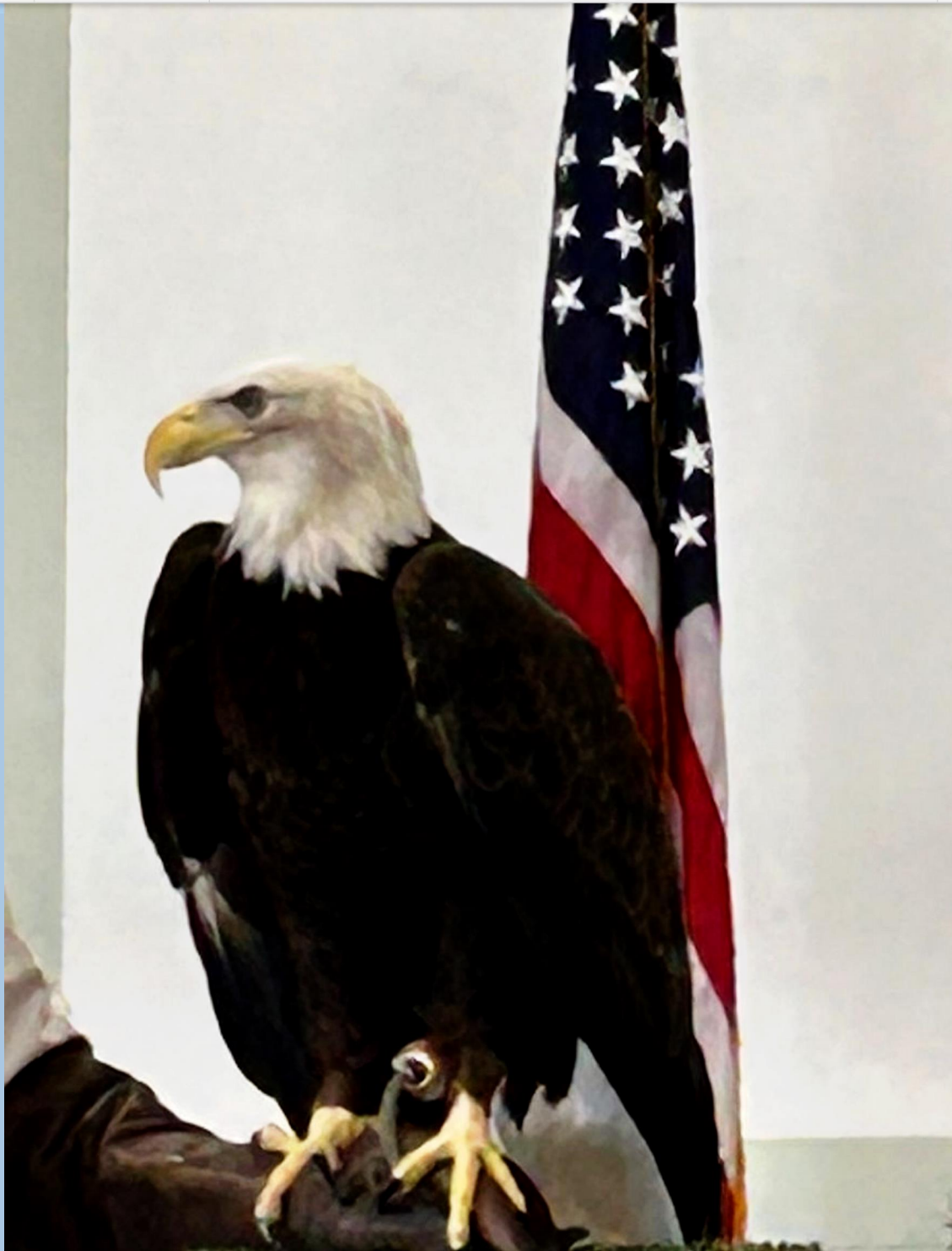
Eagle Fest at the Nature Center!