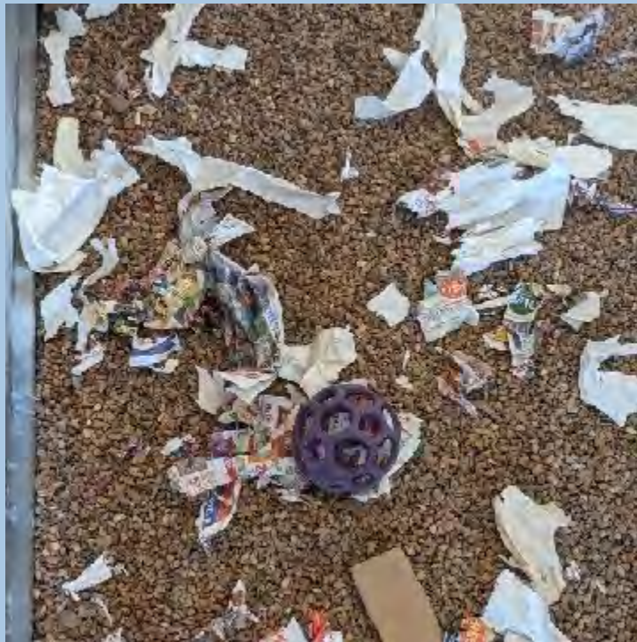
Raptor Enrichment on Thursday was a success. How do we know?