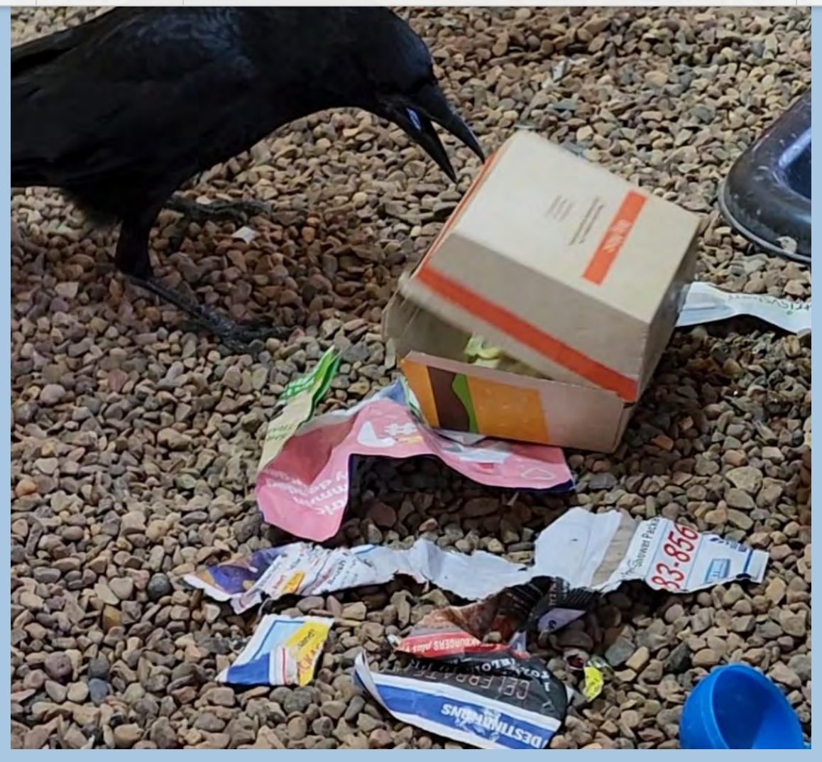
Azul rips into a fast food box filled with tasty treats (not fries!!)

Speedy takes a bath! Yes, Raptors do bathe regularly!!