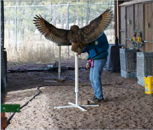
Those huge, powerful wings can't belong to a six month old owl, can they? They do! That is Simon!